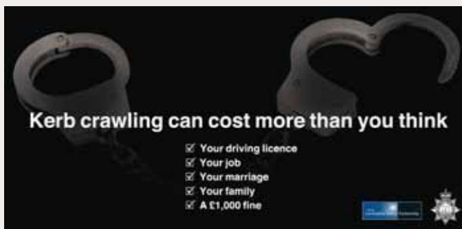
Advertising campaign highlighting the risks of kerb crawling

As well as continuing with this work, we will be developing new ways of providing services to those most at risk of violence including 'honour-based' violence, stalking and harassment. These include: