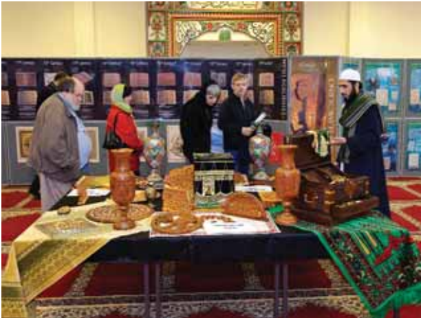
People from across Derby took part in the Essence of Islam open days, held at Derby Jamia Mosque as part of our 'Building bridges' programme.