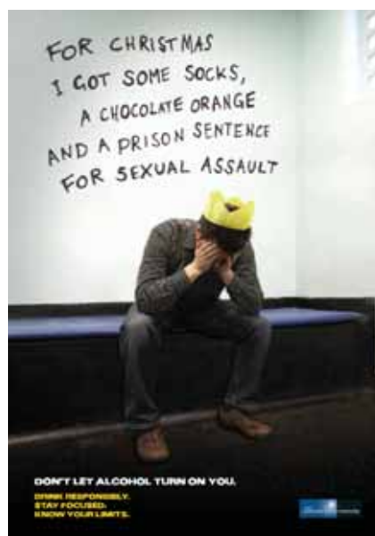
Poster campaign combating alcohol-related sexual assaults