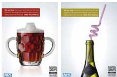
Know your limits campaign raising awareness of the unit contents in alcohol