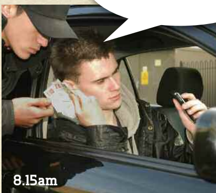
Just minutes later, in a city centre car park...

"That'll be £60 mate... I can get more anytime."