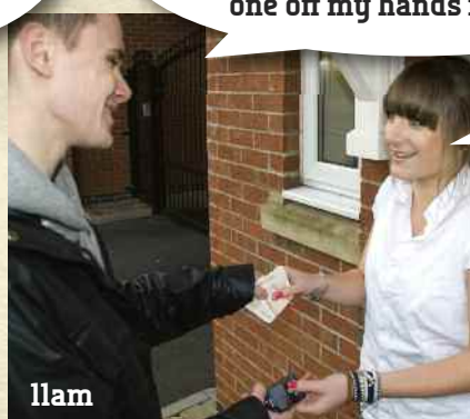
Later that day...

"Who'd have thought I'd get two of these for Christmas? Want to take one off my hands for £120?"