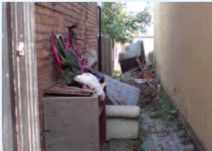
Flytip your waste and you could be fined up to £50,000 – or £5,000 if someone else flytips your waste.

To help us catch them, we need to get information like vehicle registration numbers and descriptions; time and place; what the people looked like and what they dumped. However, please don't put yourself in danger.